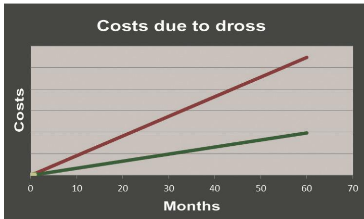
— SnAg0,3P non-“fresh” — SnAg0,3P “fresh”

Costs due to dross related losses using SnAg0,3P in a static solder bath